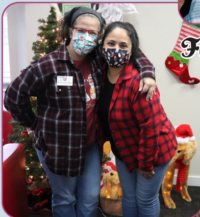
Favorite Flannel Day!