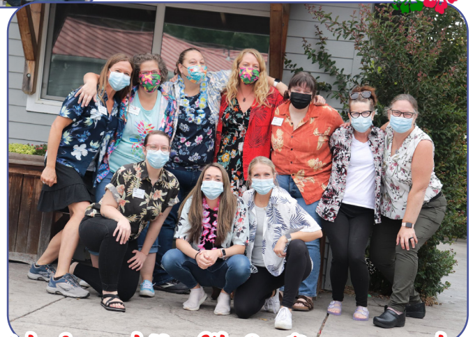
Admin and Health Center peeps who dressed up for Hawaiian Shirt Day!