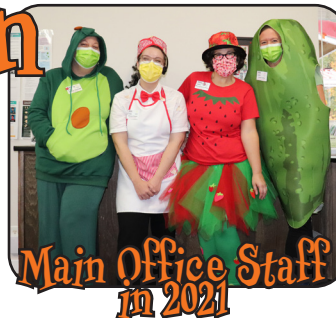
Main Office Staff in 2021