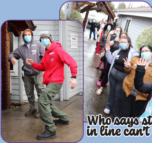
Who says standing in line can't be fun?