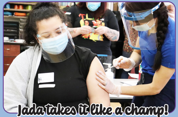
Jada takes it like a champ!