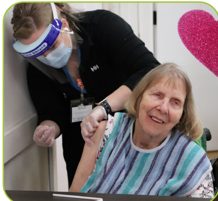
Our residents receiving their vaccines with care and compassion.

We want to give a special thanks (again) to Walgreens for coming out for this!