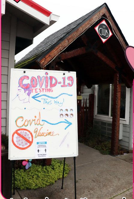
A sign for testing and vaccinating!