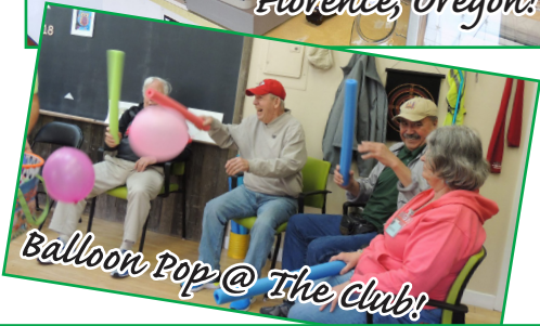
Balloon Pop @ The Club!