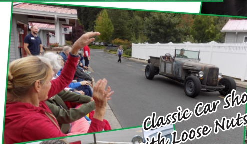
Classic Car Show @ EHL with Loose Nuts Street Rods!