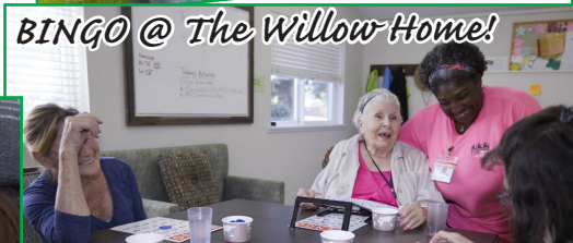
BINGO @ The Willow Home!