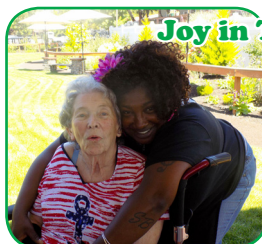
Joy in The Park!